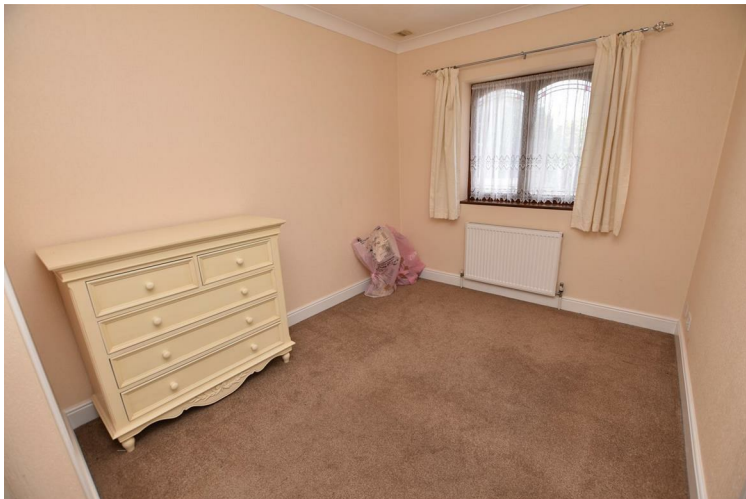
Bedroom Three 13'0 x 8'10 max (3.96m x 2.69m max)

Wooden framed double glazed window to front aspect, carpet, coved smooth plastered ceiling, radiator, TV and power points.