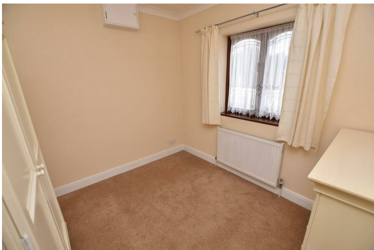
Bedroom Four 9'11 x 9'0 (3.02m x 2.74m)

Wooden framed double glazed window to front aspect, carpet, coved artex ceiling, radiator, TV and power points.