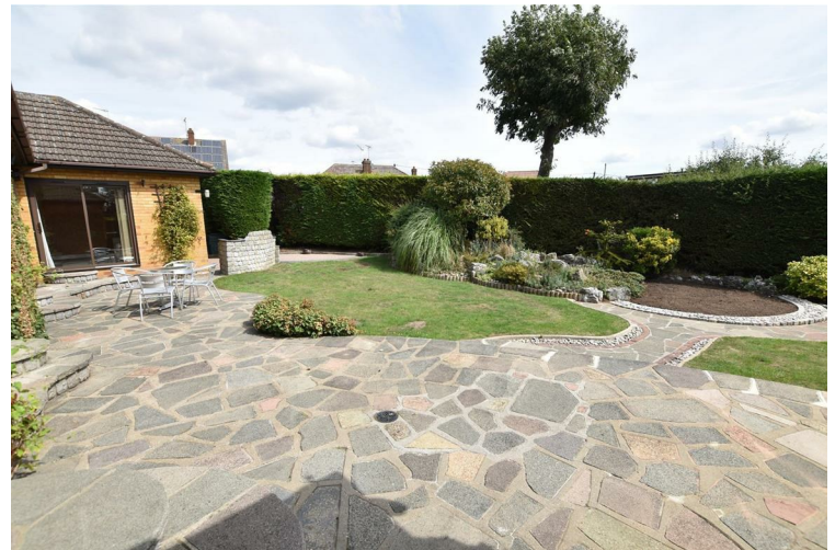
Rear Garden approx 74' wide (approx 22.56m wide)

Landscaped rear garden, crazy paved patio area to rear of property stepping down to lawn, planted boundaries and rockery, brick built BBQ, access door to garage and side access, external lights and power points. Two wooden shed plus a large concrete prefab shed.